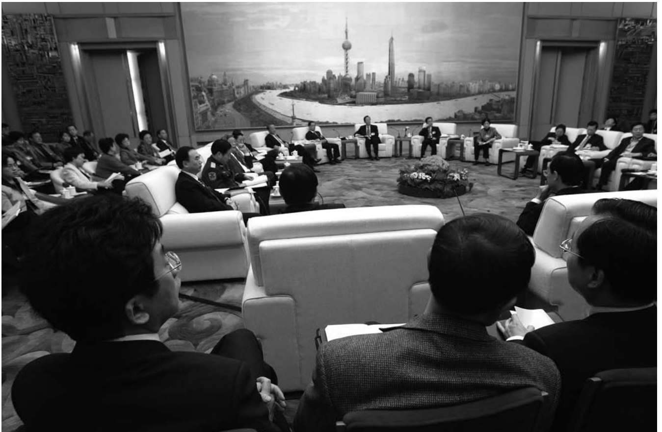
Delegates from Shanghai meet with central government officials during the 2007 session of the National People’s Congress, during which measures to discourage torture in possible death penalty cases were discussed.

The term “death penalty” will be used to refer to both types of death sentences, but the specific term death penalty (immediate execution) will be used if the scope of review only covered such cases.